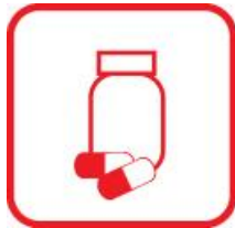
NATURAL HEALTH PRODUCTS