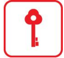
TOURISM & HOSPITALITY