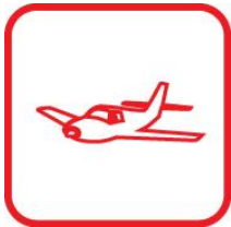
AEROSPACE & TRANSPORTATION