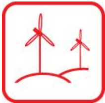
GREEN TECH & AUTOMATION