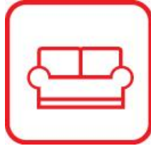
DESIGN & HOME DECOR