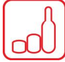
FOOD & WINE